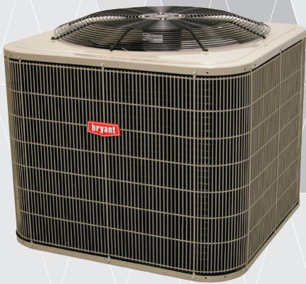
Models 115S, 114S